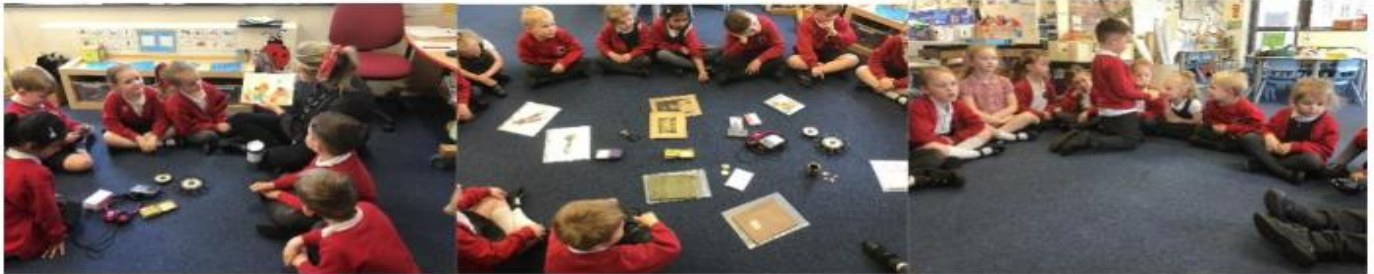
BLOSSOM CLASS: Our Antiques Roadshow.

The Antiques Roadshow came to St Peter's this week! The children had a ball exploring and examining the different historical artefacts that had been brought in. They had the opportunity to develop their enquiry and questioning skills as they tried to make claims about what the different artefacts might have been used for or how old they thought they might be. A big thank you to our St Peter's families for digging out such fascinating sources for us to enjoy looking at. You can see lots more photos on the History page of our school website.